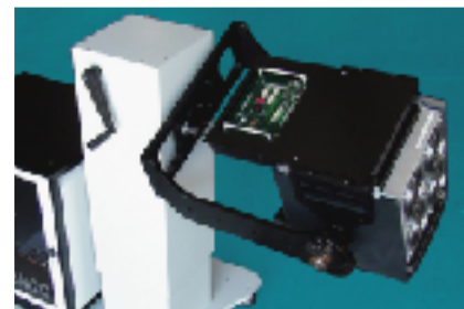
Shown with 3MTS' Model 3M20 Tester